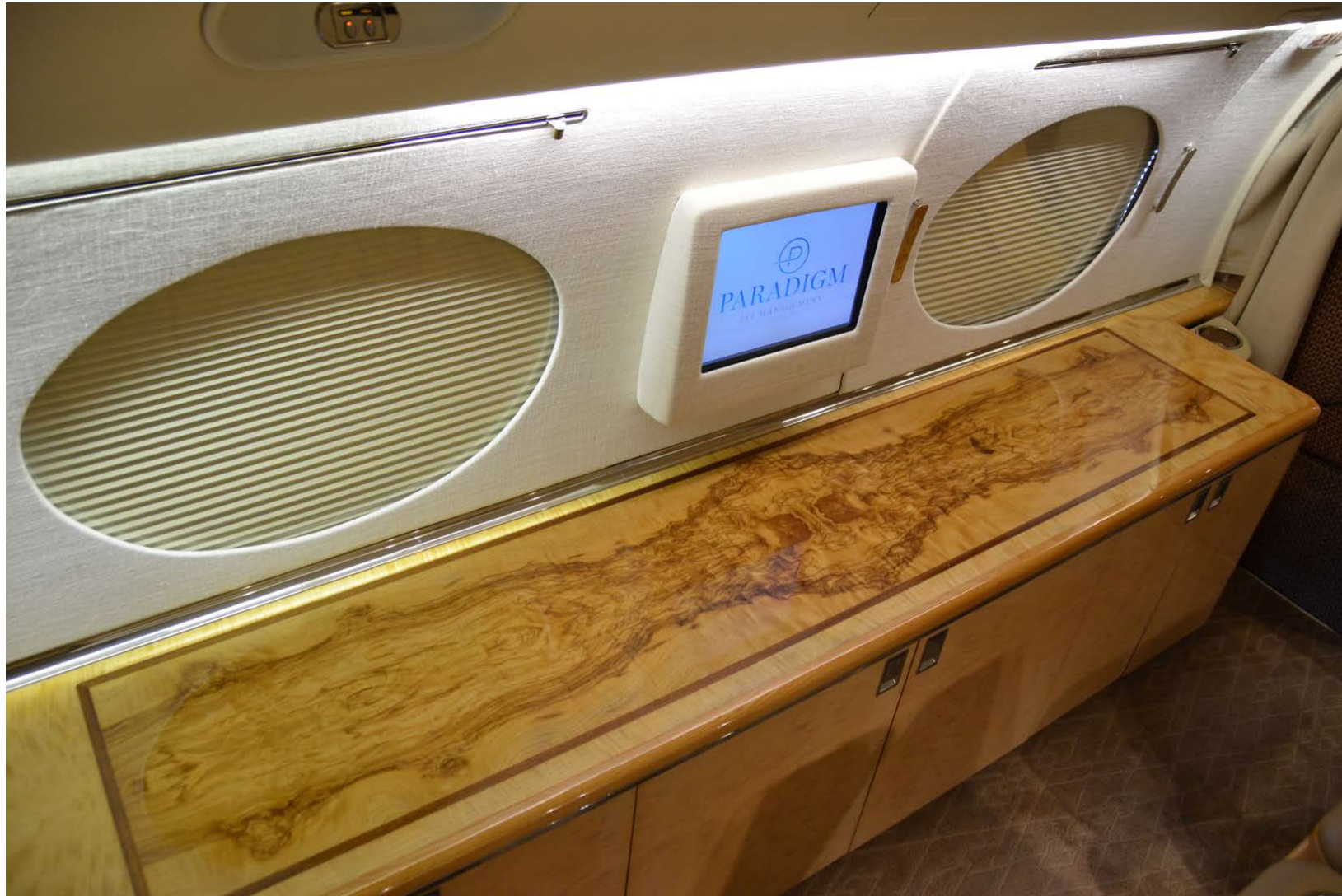
Mid Cabin Credenza