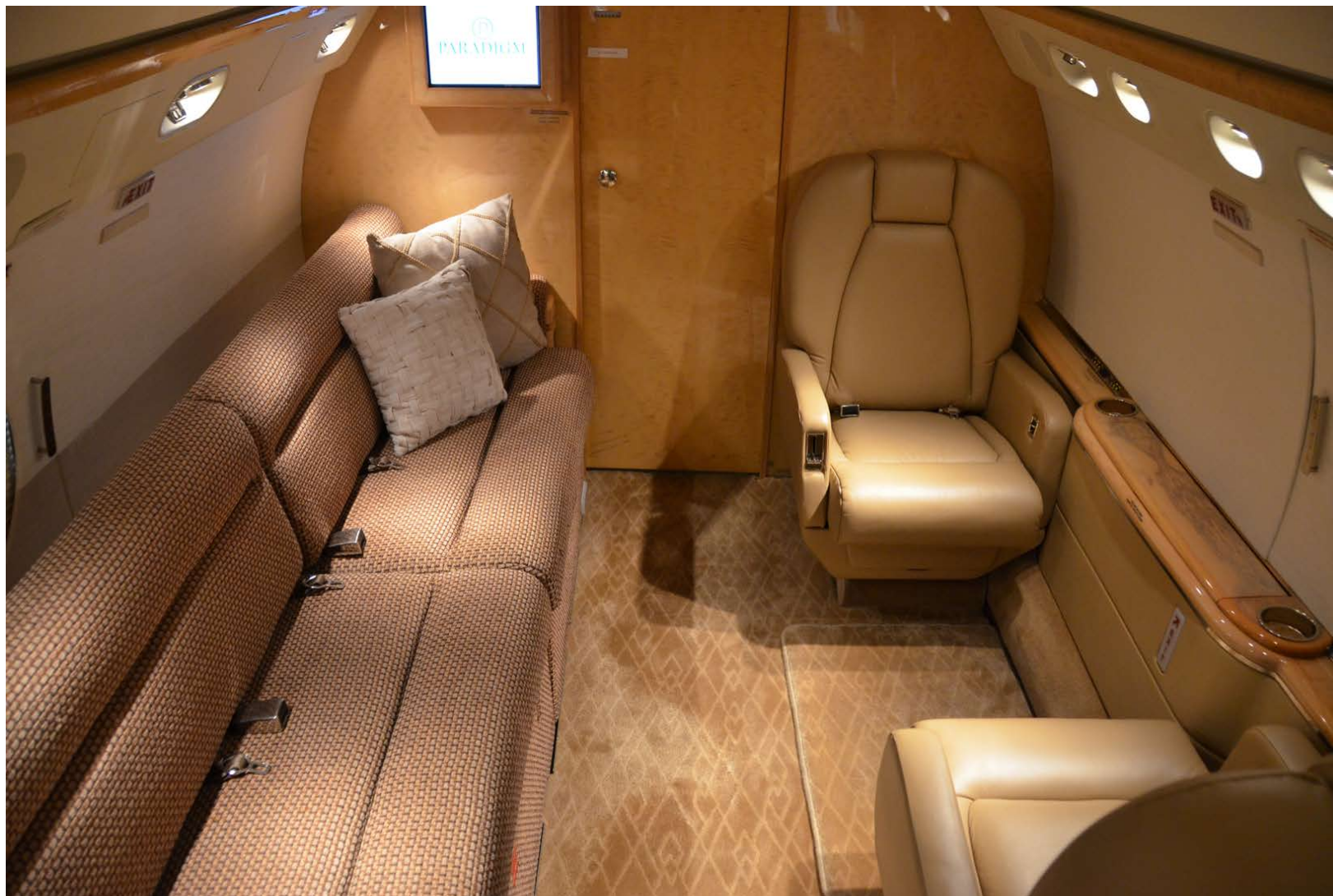
Aft Seating Group